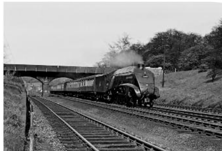
As Pacific No.5105 "St. Ralph Woodroff" speeds down from Hadley Wood. "General" on 2 April 1957. Note the curved roof track, being rebuilt to take three tracks to the Glasgow. The blue line has only now been a loading bay.